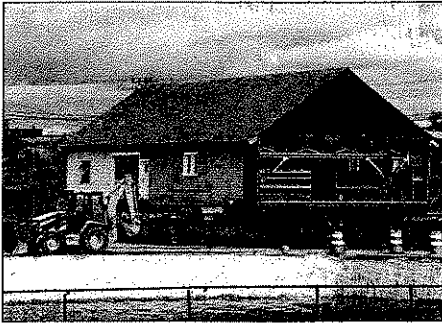
Canal freight house moves to its new location.

Years of planning and partnerships between government and private interests led the way to the historic groundbreaking ceremony this September to mark the start of construction on the Syracuse Inner Harbor development project.